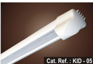
Cat. Ref. : KID - 05