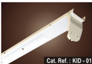
Cat. Ref. : KID - 01