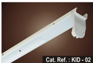
Cat. Ref. : KID - 02