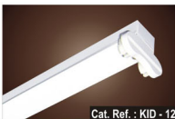
Cat. Ref. : KID - 12