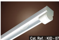
Cat. Ref. : KID - 07