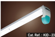
Cat. Ref. : KID - 23