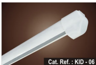
Cat. Ref. : KID - 06