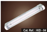
Cat. Ref. : KID - 04