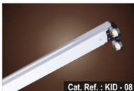
Cat. Ref. : KID - 08