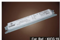
Cat. Ref. : KICG 19

M.R.P. New Std. Pack of 75 Pcs. Rs. 525/- (each) Std. Pack Wt. Kg. App.