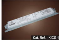
Cat. Ref. : KICG 18

M.R.P. New Std. Pack of 75 Pcs. Rs. 500/- (each) Std. Pack Wt. Kg. App.