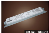
Cat. Ref. : KICG 17

M.R.P. Std. Pack of 100 Pcs. Rs. 260/- (each) Std. Pack Wt. Kg. App.