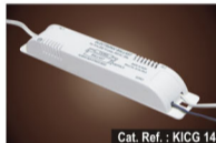
Cat. Ref. : KICG 14