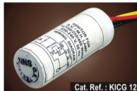
Cat. Ref. : KICG 12