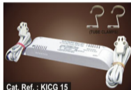
Cat. Ref. : KICG 15

M.R.P. Rs. 240/- (each) Std. Pack of 100 Pcs. Std. Pack Wt. Kg. App.